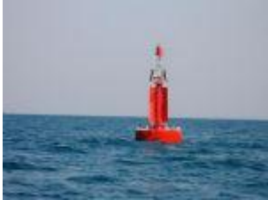
Number 6 - 12° 25.150' 130° 46.850'