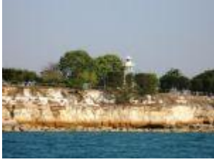
Emery Point Light House