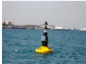
Number 11 - 12° 29.150' 130° 50.017'