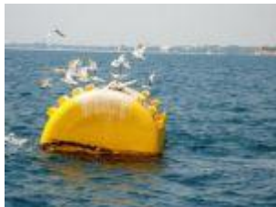
Submarine Buoy (Birds)