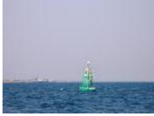
MA 1 12° 28.818' 130° 48.650'