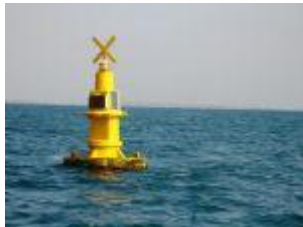
Number 10 - 12° 28.540' 130° 49.880'