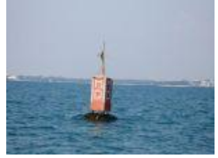
Mandora Buoy 12° 27.31' 130° 46.27'