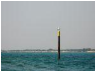
Sand Bar Pole – 12° 27.06' 130° 48.90'