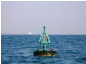
Number 9A - 12° 28.371' 130° 48.368'