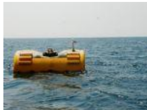
Submarine Buoy – 12° 28.02' 130° 47.58'