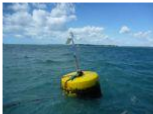
G buoy - 12 ° 25.10' 130° 47.73'