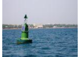
Number 9 - 12° 28.037' 130° 48.065'