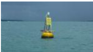
F buoy - 12 ° 25.52' 130° 48.11'