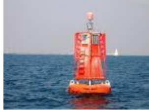
MA 2 12° 29.411' 130° 49.275'