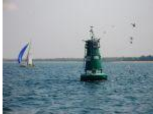
Number 7A - 12° 26.073' 130° 46.823'