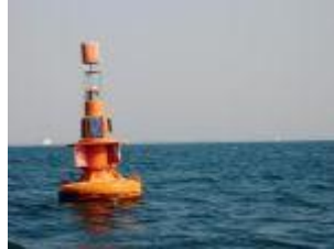
Number 8 - 12° 25.012' 130° 48.986'